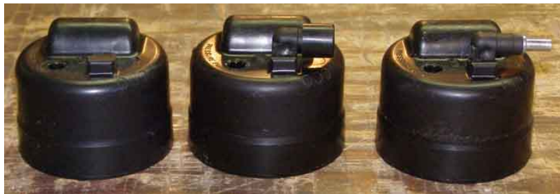
End covers with

The vent on the end cover of the pump is not there to cool the electrics, as has been stated from some sources, it is just an additional vent to expel any pressure caused by the upward travel of the diaphragm.